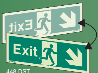
448 DST 448 DSK, 448 DSJ, 448 DSQQ