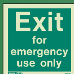
4060 C 4060 E, 4060 Q