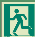
488 C 488 E, 488 Q