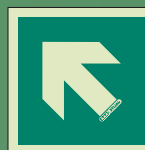
4870 C 4870 E, 4870 Q