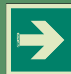
4860 C 4860 E, 4860 Q