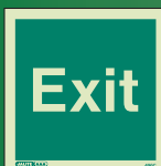
496 C 496 E, 496 Q