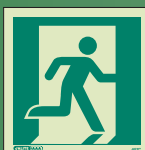
487 C 487 E, 487 Q