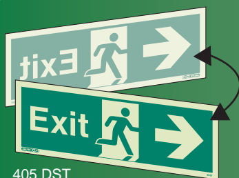
405 DST 405 DSK, 405 DSJ, 405 DSQQ