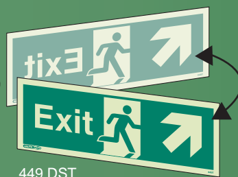
449 DST 449 DSK, 449 DSJ, 449 DSQQ